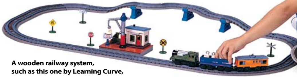
A wooden railway system, such as this one by Learning Curve, exposes kids to trains at a young age.