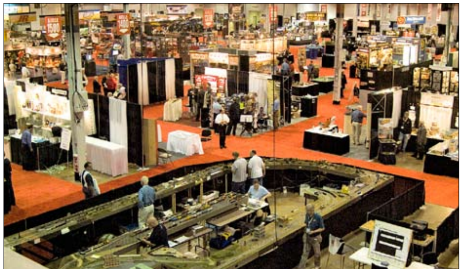
There's no better way to experience the hobby than by attending a train show. Many shows feature operating layouts, like the one above.