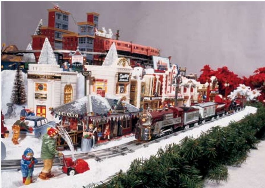
Nothing says Christmas like a toy-train layout. Many holiday buildings and accessories are widely available to help you get started.